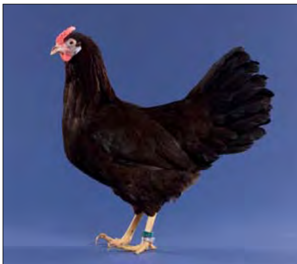
Notice the outline of this Rose Comb Dark Brown Leghorn: full deep breast; long body; deeper in the rear where the egg organs are located; and legs set in the middle of her body. Such a hen will be productive for many years.

5. Color – You can’t eat color. So why should any consideration be placed on this trait? Color can and does impact a breed’s suitability for different systems of production. For example, while white chickens are healthy and will do well on pasture, white chickens are slightly more prone to predation. Color can also be an