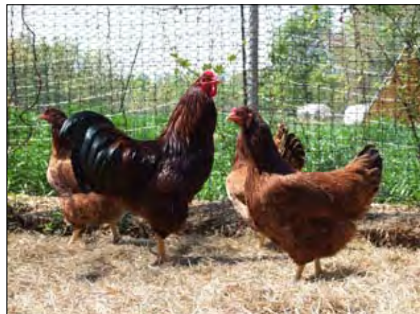
A nice pen of Buckeye chickens showing deep, productive bodies.