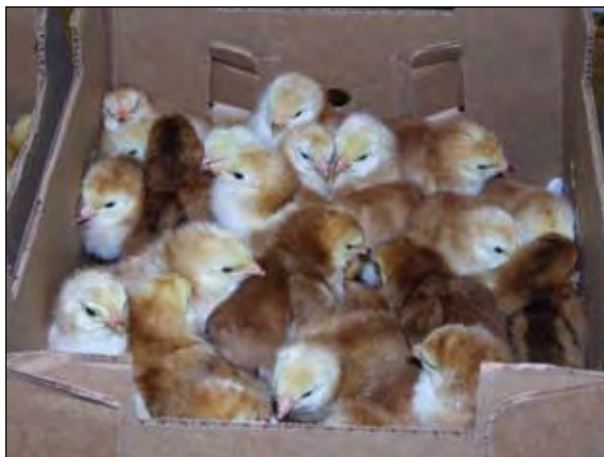
Healthy, robust chicks should be the goal of every breeder.

However, there are some basic ideas that should be kept in mind as you progress. In the first year of selection there is much advantage to emphasizing rate of growth and body capacity. Males in particular must be viewed not only for their obvious positive qualities, but also for their potential to produce both excellent sons and daughters. To that end, appraising males as if the were hens in production of eggs greatly supports the maintenance of egg production within the strain. It is better