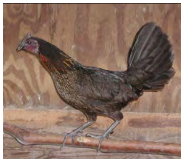
Notice the outline of this American Game hen: full large breast; narrow, pinched saddle area (where egg organs are located); and shallow body evenly deep. Such a body is designed to produce large breast muscles but is not suitable for sustained production of eggs.