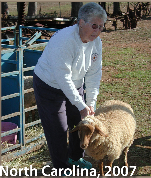
North Carolina, 2007