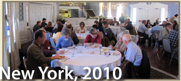
New York, 2010