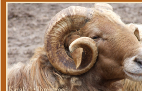
Korakul • Threatened

Assistance to gene banks to identify important genetic materials that should be collected from endangered breeds.