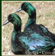
Cayuga • Critical