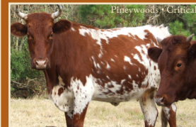
Pinewoods • Critical

Genetic rescues of threatened populations.