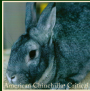
American Chinchilla • Critical