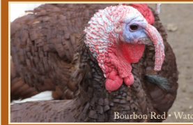
Bourbon Red • Watch

Education about genetic diversity, breed attributes, and the role of livestock in a more sustainable agriculture.