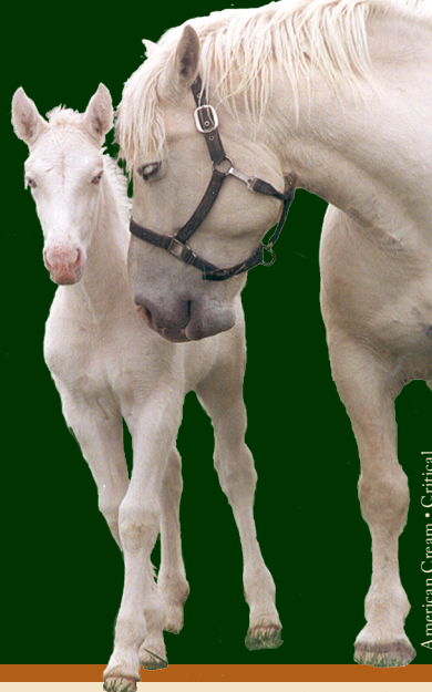
American Cream • Critical

Food and Agriculture Organization of the United Nations