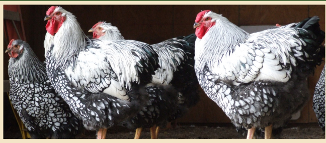
Silver Laced Wyandotte • Recovering

“Our mission is to ensure the future of agriculture through the genetic conservation and promotion of endangered breeds of livestock and poultry.”