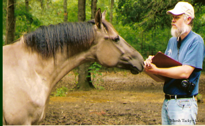
Marsh Tacky • Critical