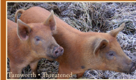
Tamworth • Threatened

Technical, marketing, and promotional support to a network of breeders, breed associations, and farmers.