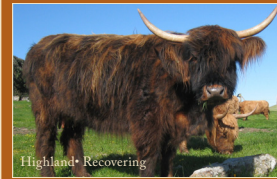
Highland • Recovering

Research on breed characteristics and populations. Annual publication of the ALBC Conservation Priority List .