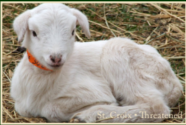
St. Croix • Threatened

“Our mission is to ensure the future of agriculture through the genetic conservation and promotion of endangered breeds of livestock and poultry.”